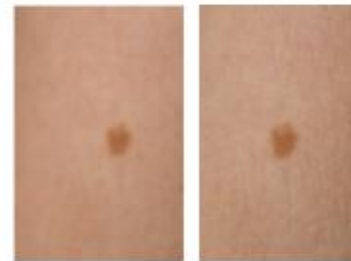
OUT OF FOCUS IN FOCUS