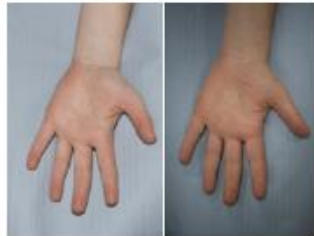
FLASH ON FLASH OFF