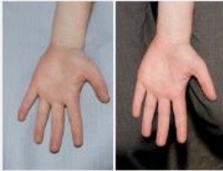
CLEAR BACKGROUND UNCLEAR BACKGROUND